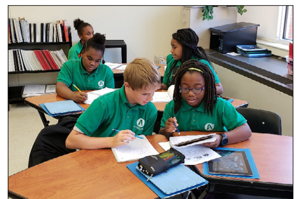
AAD Middle and High School Newport News