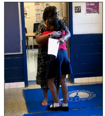
AAD Academy Newport News