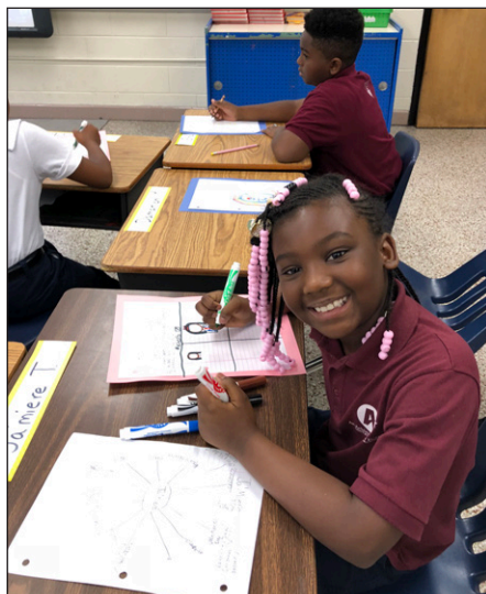
Highland Springs Elementary AAD Academy

On Monday, July 9, all AAD schools began Summer Intercession, our innovative summer learning program. Here's a glimpse of Intercession at each of our schools!