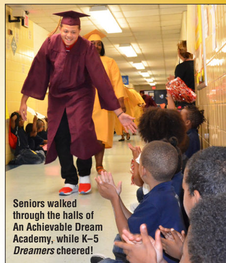
Seniors walked through the halls of An Achievable Dream Academy, while K-5 Dreamers cheered!