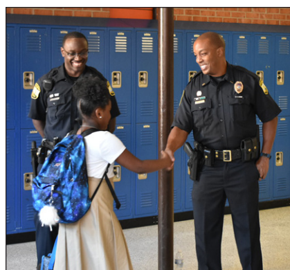
AAD Middle School Program at Lynnhaven Middle School